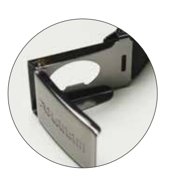
Practical and always to hand: the integrated bottle opener