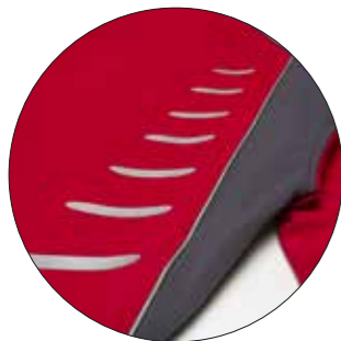
Motive „Brush“ Product no. 9901401 Measurements: approx. 25 x 9,5 cm

Reflective tape For even better visibility we sew on or patch on reflective tape for you – customisable to suit your requirements.