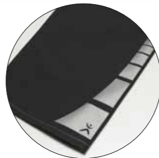
Motive „Square“ Product no. 9901402 Measurements: approx. 25 x 7,5 cm