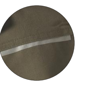
The reflective strips underneath the knee emphasise the sporty design