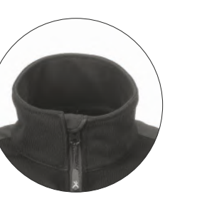
Backed zip with pinch protection for comfortable handling