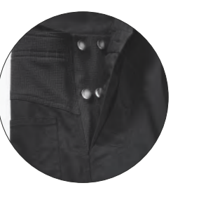
Always fits perfectly - thanks to its adjustable waist