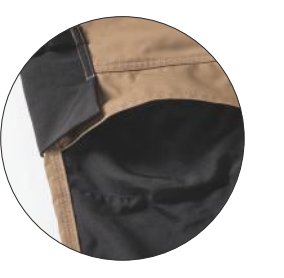
Knee pockets for inserting protective knee pads