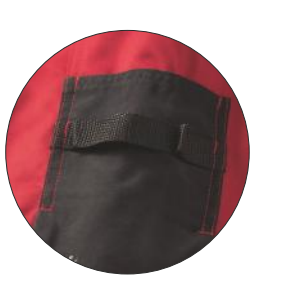
Always have your important tools to hand thanks to the ruler pocket