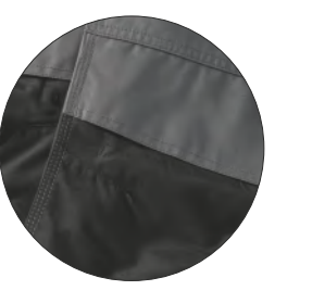
The knee pockets allow for the use of knee pads