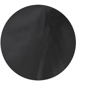
elastic inserts at the crotch