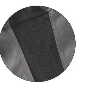
Stretch inserts in the crotch area for optimum freedom of movement its higher, elastic waistband