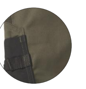
More space for work tools in the ruler pocket