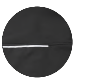
Reflective piping as a visual highlight in the darkness