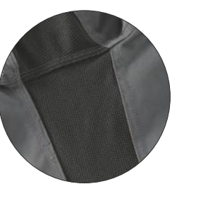
The elastic fabric in the crotch ensures you are very comfortable