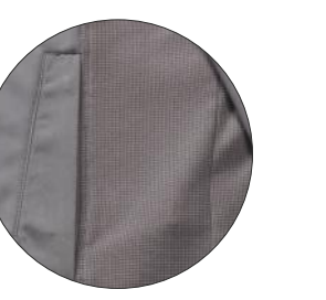
Very comfortable to wear thanks to elastic inserts on the sides