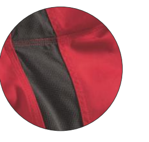
The elastic fabric in the crotch ensures you are very comfortable