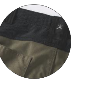
Elastic, high waistband for optimum comfort