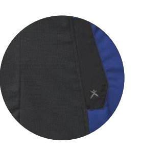
Suitable for any body shape thanks Side pockets with reliable zip to its elastic inserts