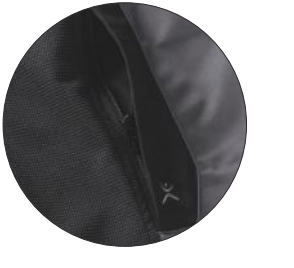
Fits any body shape thanks to side Side pockets with reliable zip stretch inserts