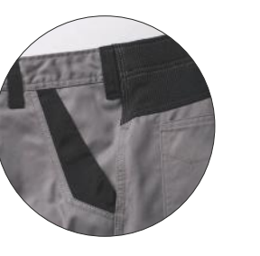
Very comfortable to wear thanks to