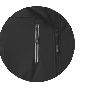
Closable breast pocket for valuables