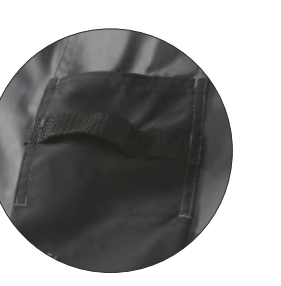
More space for work tools in the ruler pocket