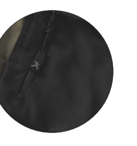
Thigh pockets for your most important utensils