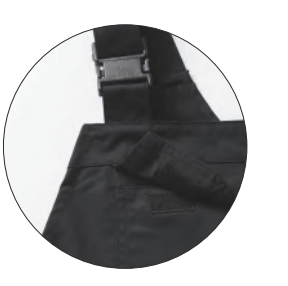
Your smartphone or pens are always More freedom of movement with close at hand in the roomy bib pocket