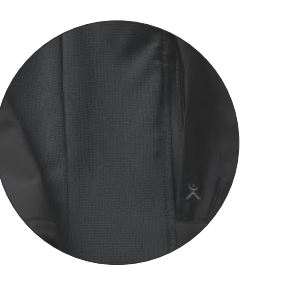
Very comfortable to wear thanks to elastic inserts on the sides