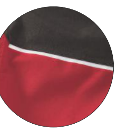
The reflective strips underneath the knee pocket emphasise the sporty design