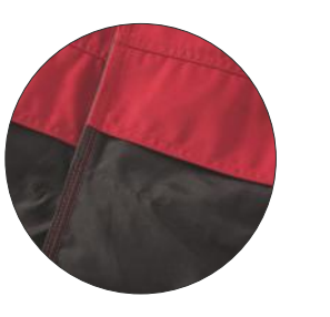
The knee pockets allow for the use of knee pads