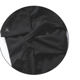
Knee pockets for inserting protective knee pads