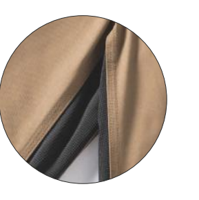
elastic inserts at the crotch