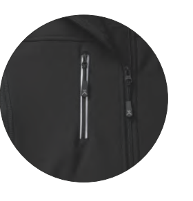
Small treasures are well stowed away in the zipped chest pocket