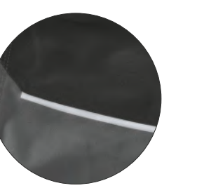
The reflective strips underneath the knee pocket emphasise the sporty design