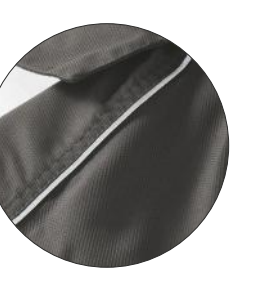
When illuminated, the reflective stripes on the shoulder reflect