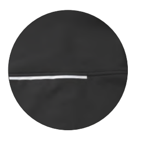
Reflective piping as a visual highlight in the darkness