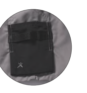
Everything ready and to hand in your thigh pocket