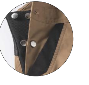
Always fits perfectly - thanks to its adjustable waist