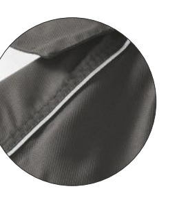
The reflective piping on the shoulder highlights the dynamic look