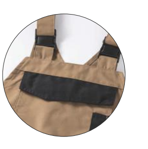
Your smartphone or pens are always close at hand in the roomy bib pocket