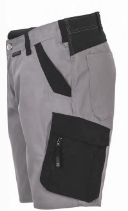
360° View this item in all available colours under "Products" at planam.de