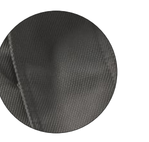
The structure of the material keeps moisture out and creates a fashionable highlight