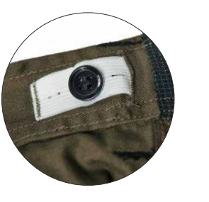
Internal adjustment options in the waistband mean our trousers fit every child